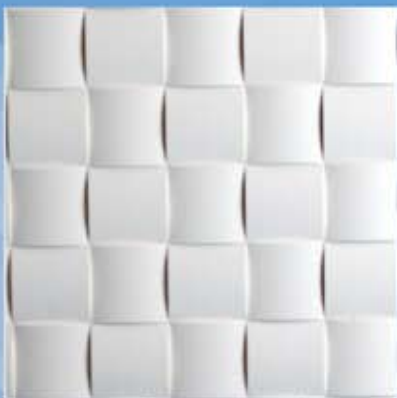
TITAN TWO INCH WEAVE