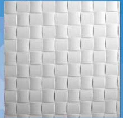
TITAN ONE INCH WEAVE