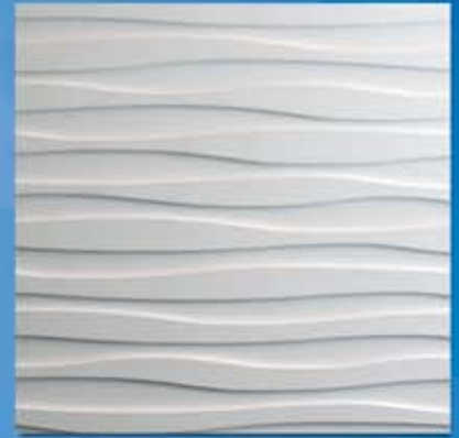
TITAN DEEP SURF H