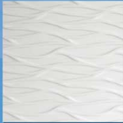
TITAN BIO 8F